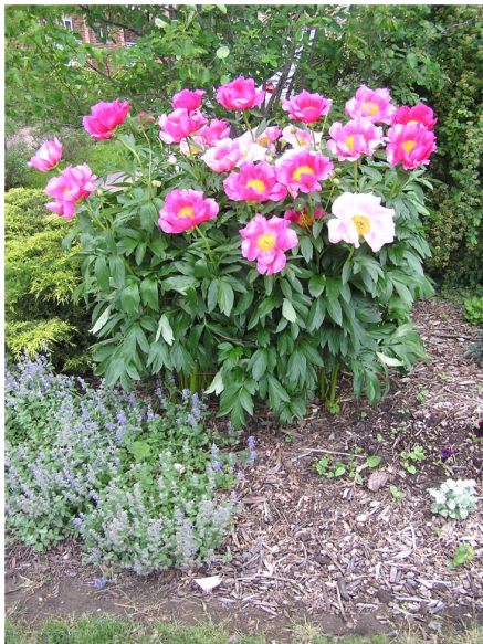
Kruse Garden Peony from Klemms Nursery