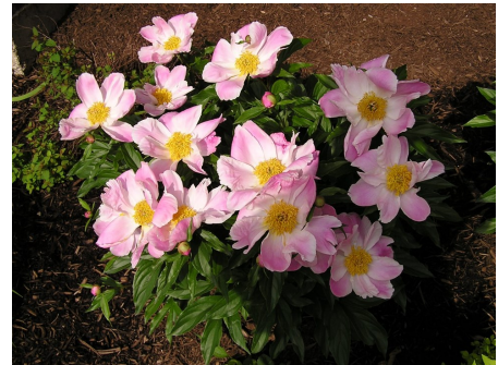
Single Shell Pink Peony

The peony displays were spectacular! The Single Shell Peony, donated by Billie, has large single flowers of delicate pink with yellow centers. In front of the house is a lightly scented, semi-double flower peony, from Klemms Nursery (photo on page 5), that stands upright over three feet. Behind the garage, is a fabulous pink, full double bloom peony, original to the house. Its fragrance is incredible! The back and side gardens contain several other vintage varieties, including bomb-type flowers.