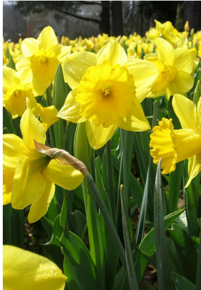
Wordsworth's Daffodils—A Spring Rite of Passage

I WANDER'D lonely as a cloud That floats on high o'er vales and hills, When all at once I saw a crowd, A host, of golden daffodils; Beside the lake, beneath the trees, Fluttering and dancing in the breeze. Continuous as the stars that shine And twinkle on the Milky Way, They stretch'd in never-ending line Along the margin of a bay: Ten thousand saw I at a glance, Tossing their heads in sprightly dance. The waves beside them danced; but they Out-did the sparkling waves in glee: A poet could not but be gay, In such a jocund company: I gazed -- and gazed -- but little thought What wealth the show to me had brought: For oft, when on my couch I lie In vacant or in pensive mood, They flash upon that inward eye Which is the bliss of solitude; And then my heart with pleasure fills, And dances with the daffodils. By William Wordsworth (1770-1850).